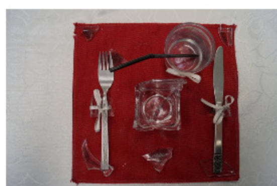
What's On Your Plate?